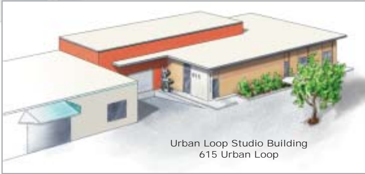
Urban Loop Studio Building 615 Urban Loop