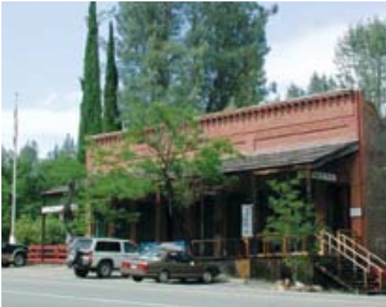
The Courthouse Museum

Stroll among the sites of Shasta, and let your imagination reflect on this once-bustling town. Today's ruins were businesses that served the area's townspeople and commerce. Walking trails pass by the 1920s