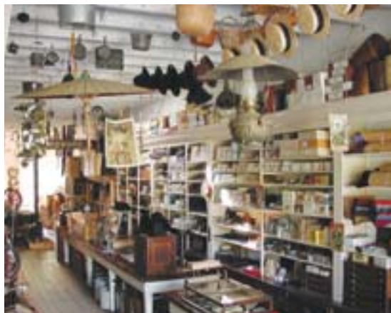
Interior of Litsch Store

The restored Litsch Store is one of Shasta's original buildings. Visitors can see what it was like to shop during the 1880s, when merchandise was displayed and stored behind the counter, and customers had to ask the clerk to assist them. The store is open during summer and fall, when staff and volunteers provide guided tours. Call for a tour schedule.