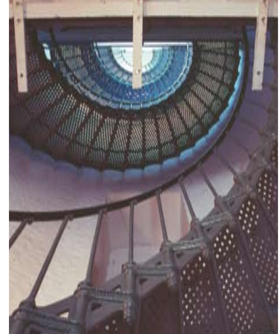
Spiral staircase inside the lighthouse

Four Light Station buildings, converted to lodging for up to 50 people, are operated by Hostelling International. Each house has two male or female bunkrooms. Separate bunkrooms can be reserved for families or couples. Hostel guests share bathrooms, kitchens and living rooms, and participate in housekeeping activities. To make reservations, call (650) 879-0633 from 7:30 a.m. to 10 a.m. or 5:30 p.m. to 10 p.m. Information is also available at www.norcalhostels.org .