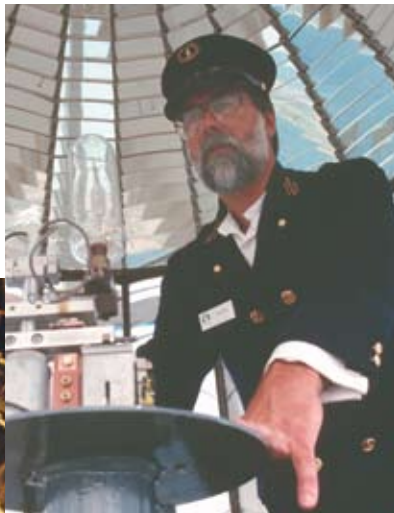
Living history demonstration

For a virtual tour of the light station and more park information, select Pigeon Point Light Station SHP at www.parks.ca.gov .