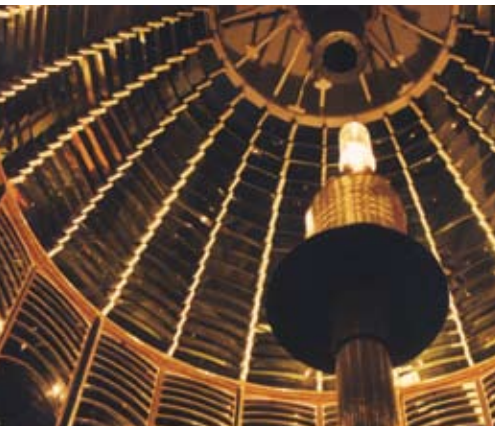
Annual lighting of the Fresnel lens

Be prepared for unpredictable weather. Rain may occur between November and March, and even summer brings chilly fog, particularly in the mornings. Stiff northwest winds can develop anytime, so dress in layers.