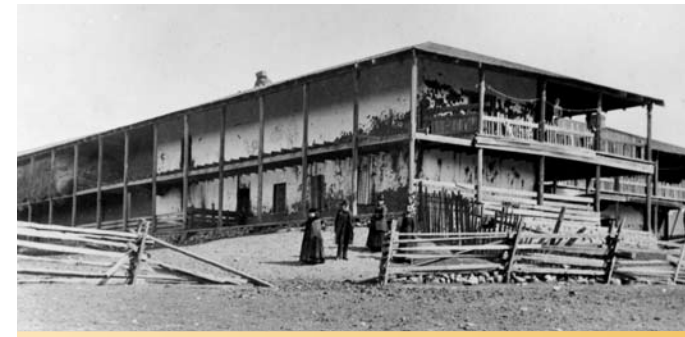
West face of historic adobe

The eastern wing of the complex was never fully completed. The portion of the building remaining today was part of a larger complex forming a quadrangle around a central courtyard. The adobe complex housed a variety of processing and manufacturing operations with storage and living space for