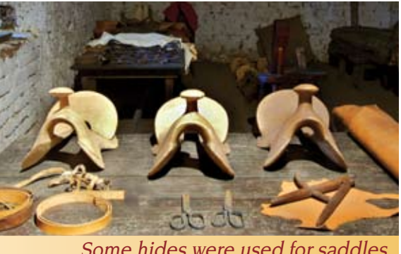
Some hides were used for saddles.

The Coast Miwok lived in the resource-rich Petaluma River Valley centuries before European incursions. Village communities sheltered in places near fresh water. The abundant tule rushes along waterways provided ample materials for constructing dwellings and boats. Wildlife, including rabbits, quail and deer, kept the Coast Miwok supplied with meat, fur and tools. Seasonally the women harvested acorns, buckeye, fruits and kelp. The ocean provided the Coast Miwok with a yearround food supply. They used nets, hooks and traps to catch freshwater and marine fish, and the women gathered crabs, clams, oysters, abalone and mussels in the tidal zones. Craftsmen transformed the cleaned