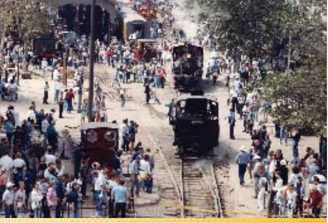
Visitors enjoy the sights and sounds at Railfair.