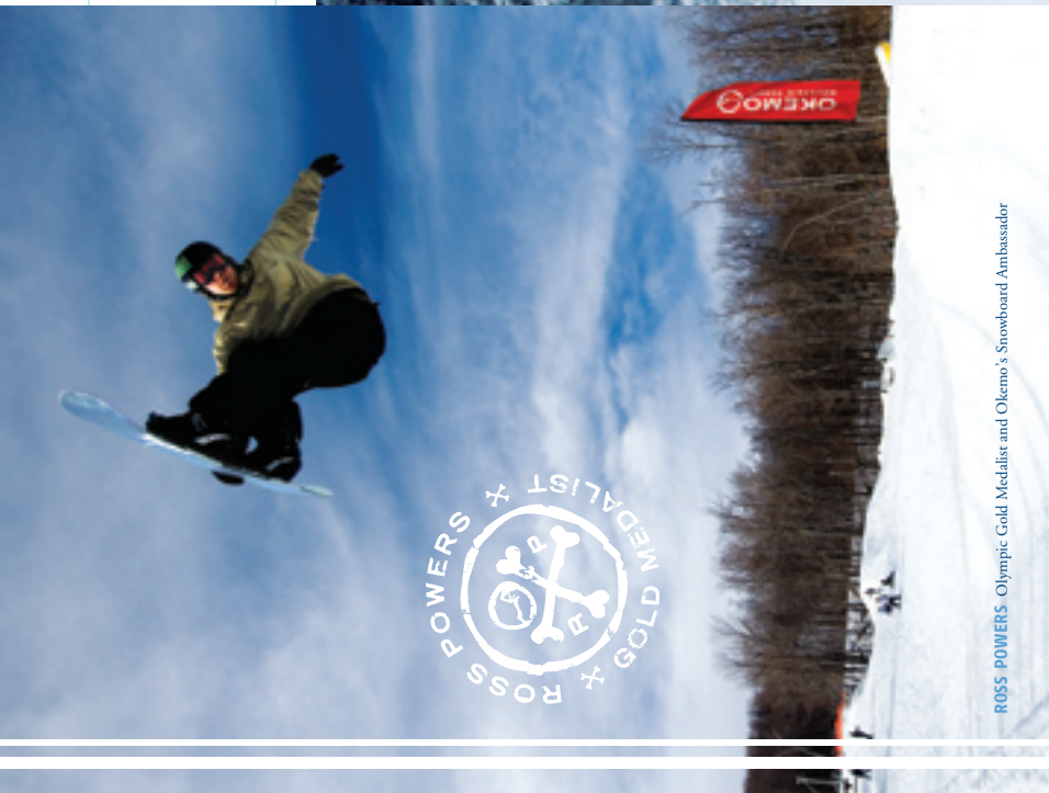
ROSS POWERS Olympic Gold Medalist and Okemo's Snowboard Ambassador