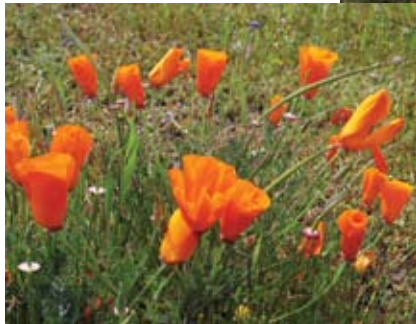
California poppies are among the many wildflowers to be found in the park.

In 1940, through the persuasive efforts of Kern County citizens, the Tejon Ranch Company deeded five acres—the old parade ground, the foundations, and remnants of the original adobe buildings—to the State of California as a state park. Restoration began on the adobe buildings in 1947 and continues to this day.