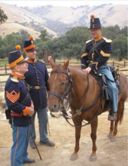
Volunteers portray Dragoons at Fort Tejon.

bottom of Grapevine Canyon and had one village, Sausu, along Castac Lake. Unlike the coastal groups, they had little contact with European explorers and settlers before the mid-1800s.