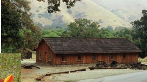
Reconstructed Quartermaster building

The original barracks building, the reconstructed officers' quarters and various other structures stand as reminders of Fort Tejon's military history.