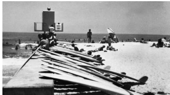
1960s-era surfers' mecca