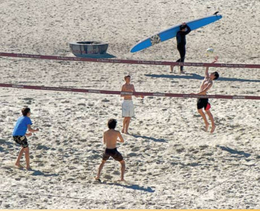
Beach volleyball is a popular sport at Doheny.