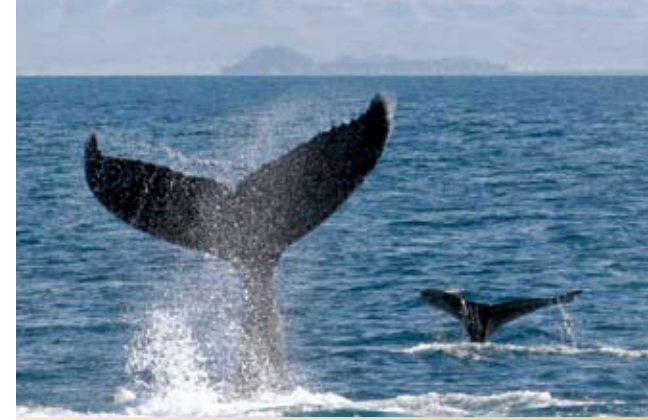
Humpback whales migrate in spring.

Dana Point became home to surfing legends like surfboard maker Hobie Alter and Endless Summer filmmaker Bruce Brown. As a surf spot memorialized in the Beach Boys' hit Surfin' USA , Doheny's beach enjoyed spectacular pipelines and point breaks until the Dana Point harbor breakwater was built in 1966. During the summer, Doheny surf still breaks consistently.