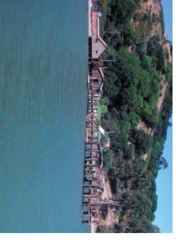
China Camp pier