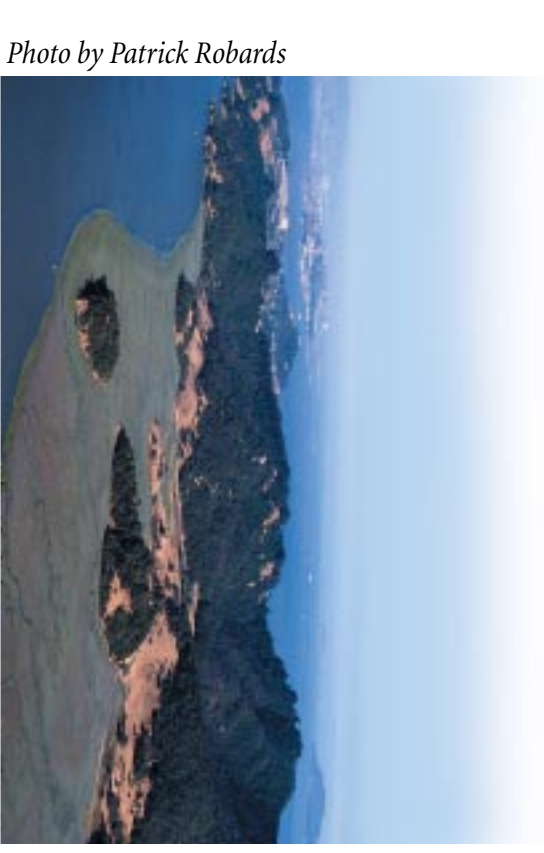
Aerial view of China Camp