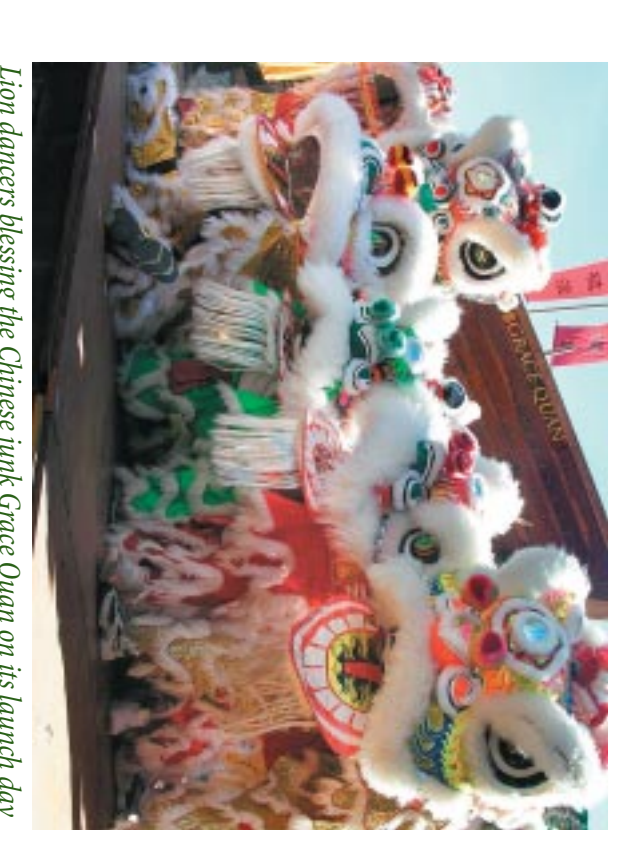
Lion dancers blessing the Chinese junk Grace Quan on its launch day