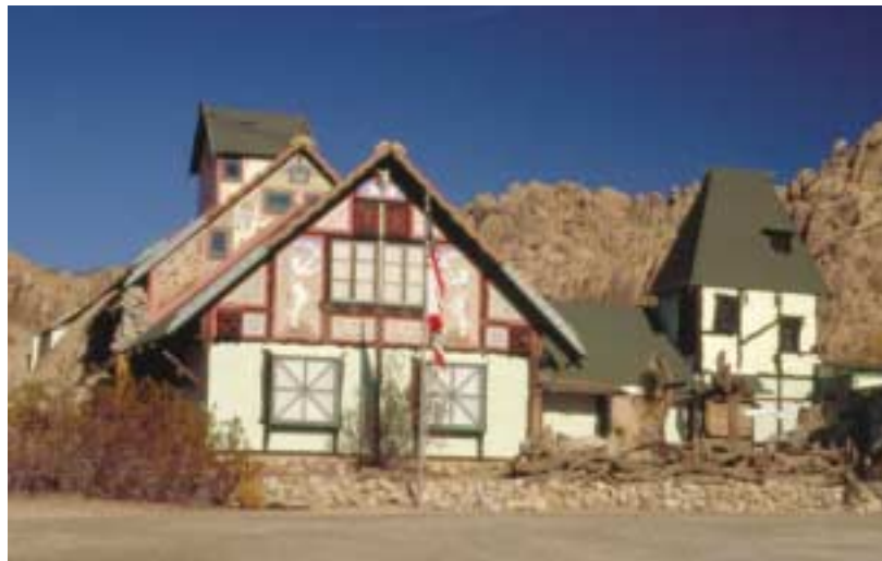
The Antelope Valley Indian Museum

Pottery —A variety of storage, cooking, utility and decorative types originate from the Southwestern and southern California cultures.