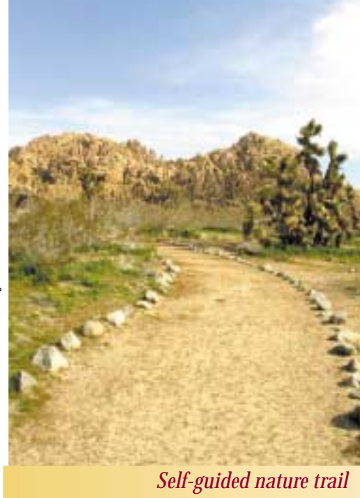
Self-guided nature trail

Accessibility is continually improving. For current accessibility details call the park, or visit access.parks.ca.gov .